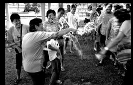
Young and old having fun together.