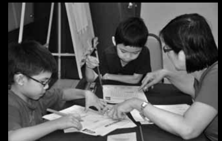
Activity work for the children.