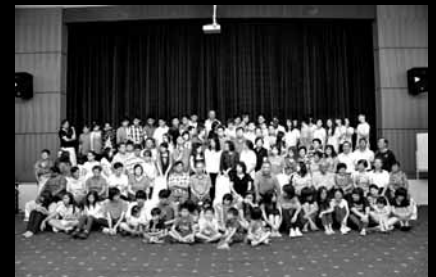
All the participants.

IG Camp with Wesley Methodist Church, Johor Baru, Felda Residences, Tanjung Leman, Mersing (7-9 June 2013)