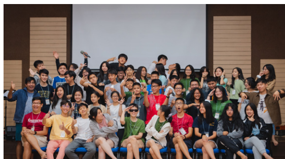
Combined PJ school CF Camp Group Photo