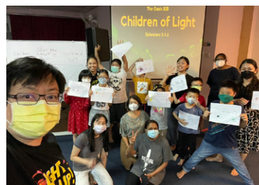
Children posing with their hand-drawn Children of Light timeline.