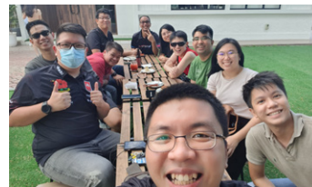
Ipoh-Kampar REACH: The Youth and Northern Region Team

Our REACH ended with us running an entire CF program at Westlake International School on Day 3.