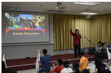
Mini Olympics at Camp

In each event, we conducted various sports training sessions where participants learnt new sports and played games together. It was a good time of sweating it out! Being able to throw a ball or a disc to one another was indeed refreshing! More importantly, we were able to share the good news of Jesus with the kids and youth. We pray that the seed of the Gospel that has been sown (some of the participants heard the Gospel for the first time) will continue to grow and bear much fruit in due time!