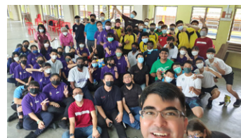
Ipoh-Kampar REACH: with the BB-GB Company at SMK ACS Methodist Kampar